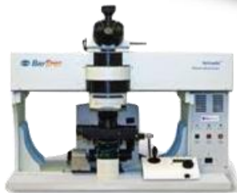
Raman Microscope with four excitation Raman wavelengths Yes FOUR!!