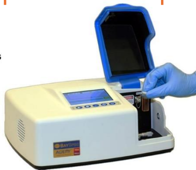
Agility dual-band Raman analyzer