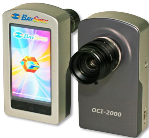
OCI-2000HH™ Handheld Snapshot Imager