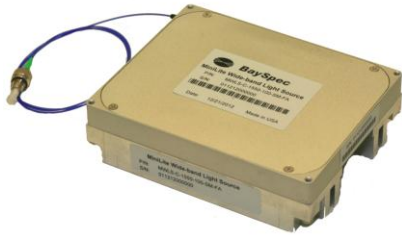
Card-mount option with Heat-sink

BaySpec's MiniLite ® Series fiber-coupled Wideband Light Sources are designed to enhance Spectral Domain Optical Coherence Tomography(OCT), Medical Imaging, Fiber Optic Sensing, Analytical Spectroscopy, and Test & Measurement capabilities in the 650nm-1690 nm wavelength region. Devices benefit from low-cost field proven telecommunication components.