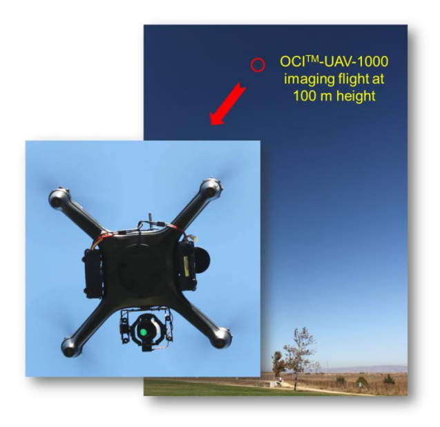
Figure 1. BaySpec's OCI<sup>TM</sup> hyperspectral imagers are ultracompact and light weight (0.3 kg total), designed specifically for use on sUAVs. Shown in the photo is the system in aerial hyperspectral imaging mission.

vibration-isolation gimbal system for its hyperspectral imagers (Figure 1)<sup>1</sup>.